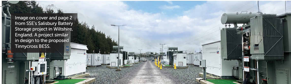
Image on cover and page 2 from SSE's Salisbury Battery Storage project in Wiltshire, England. A project similar in design to the proposed Tinnycross BESS.