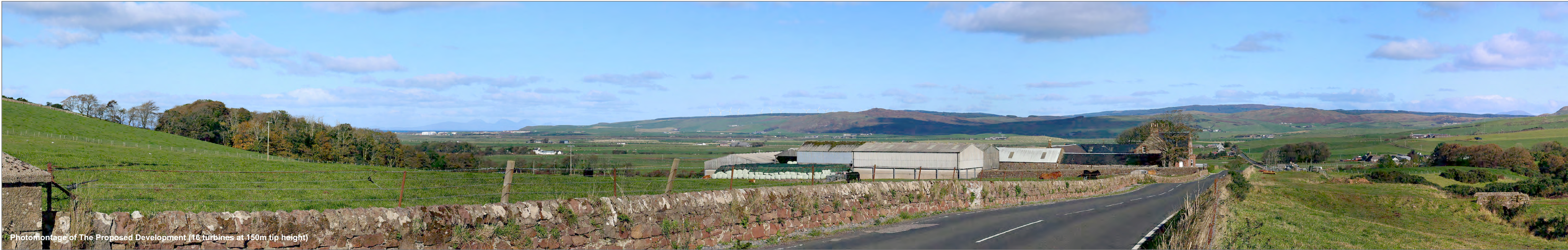
Photomontage of The Proposed Development (16 turbines at 150m tip height)