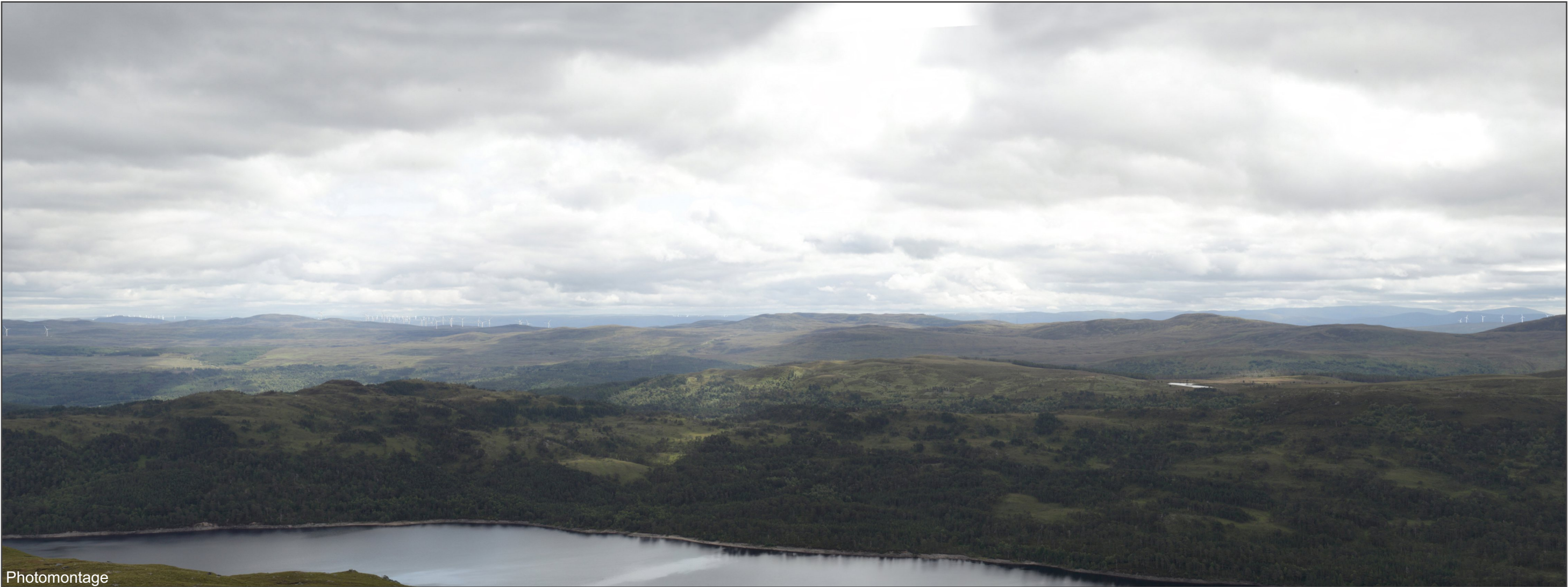
FIGURE 7.10.1.2 - VP1: Beinn a' Mheadhoin (Glen Affric)

OS reference: 221906 E 825555 N Distance to development: 33.5km Ground level: 608.5m AOD Direction of view: 126.64° Camera: Canon EOS 5D Mk II Focal length: 50mm vertical (27°) x 28mm horizontal (65.5°) Camera height: 1.5m Date: 06/07/2019 Time: 11:51 Drawing No. - 118025-D-LVIA7.10.1.2-3-1.0.0 Date - 17.04.2020