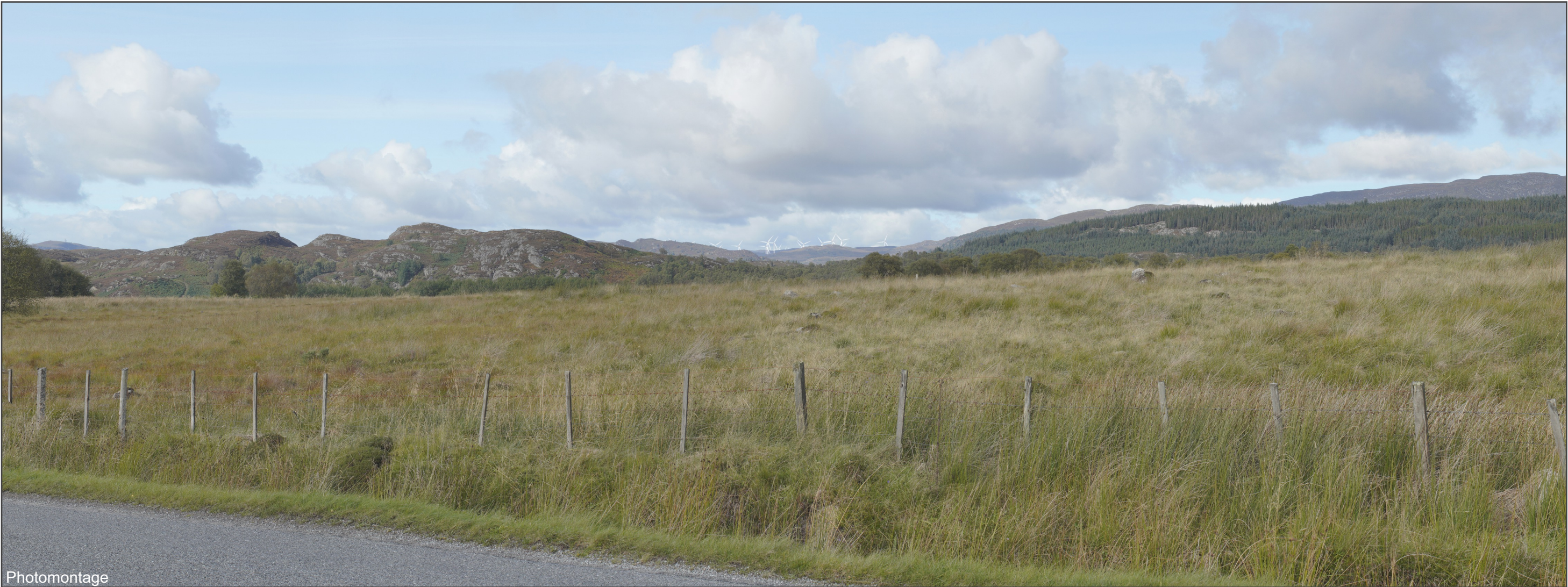
FIGURE 4b - VP7: B862 south of Foyers (15 Turbine Layout)

OS reference: 249743 E 817317 N Nearest visible turbine: 10.1km Ground level: 174.7m AOD Direction of view: 290.2° Camera: Sony A7RIII ILCE-7RM3 Focal length: 50mm vertical (27°) x 28mm horizontal (65.5°) Camera height: 1.5m Date: 23/09/2020 Time: 11:55 Drawing No. - 121025-D-AIRP-4B-1.0.0 Date - 04.03.2022