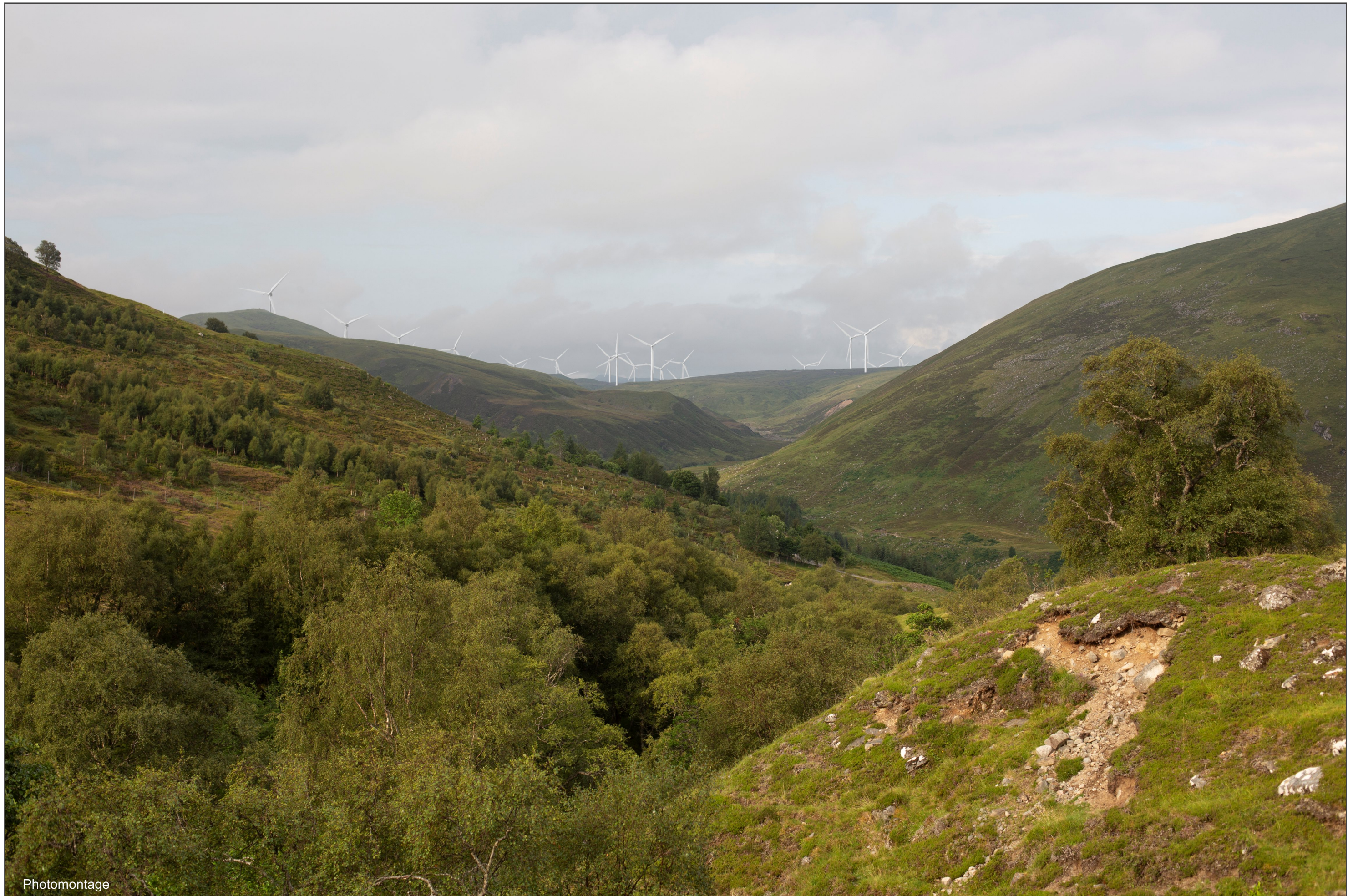
FIGURE 7.10.6.4 - VP6: Glen Markie When viewed at a comfortable arms length (approx. 500mm), this printed image is representative of our detailed central vision, but is not representative of scale and distance.

OS reference: 254356 E 807217 N Distance to development: 7.4km Ground level: 439.4m AOD Camera: Canon EOS 6D Focal length: 50mm Camera height: 1.5m Date: 31/07/2019 Time: 08:27 Drawing No. - 118025-D-LVIA7.10.6.4-6-1.0.0 Date - 17.04.2020