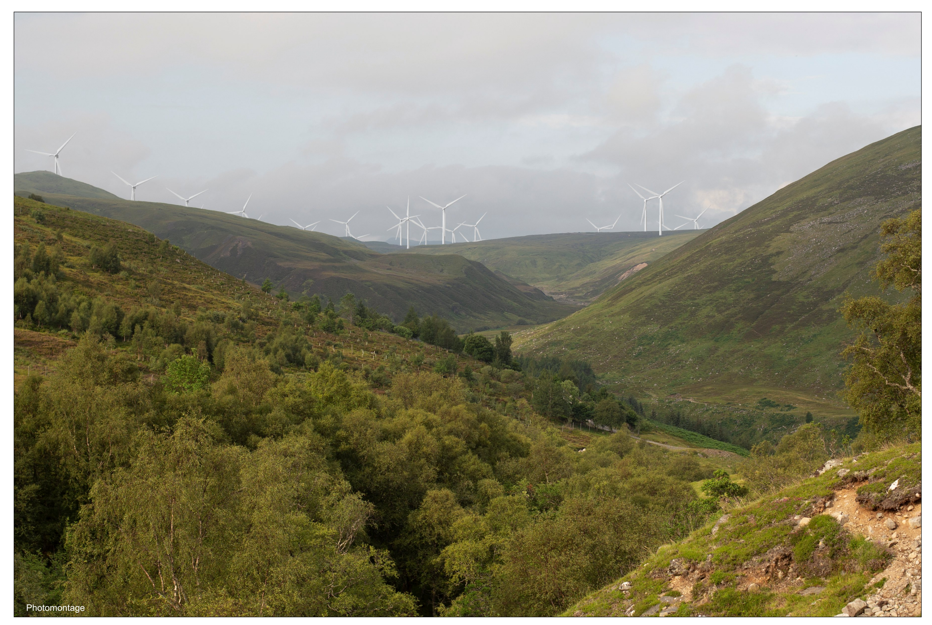
OS reference: 254356 E 807217 N Distance to development: 7.4km Ground level: 439.4m AOD Camera: Canon EOS 6D Focal length: 75mm Camera height: 1.5m Date: 31/07/2019 Time: 08:27