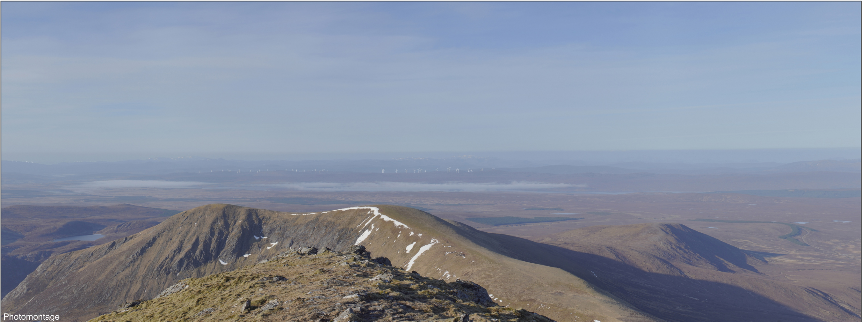
FIGURE V3b-9.2 - VP13: Ben Klibreck (Photomontage)

OS reference: 258527 E 929902 N Distance to development: 22.9km Ground level: 952.8m AOD Direction of view: 211.0° Camera: Sony ILCE-7RM3 Focal length: 50mm vertical (27°) x 28mm horizontal (65.5°) Camera height: 1.5m Date: 22/04/2021 Time: 07:44