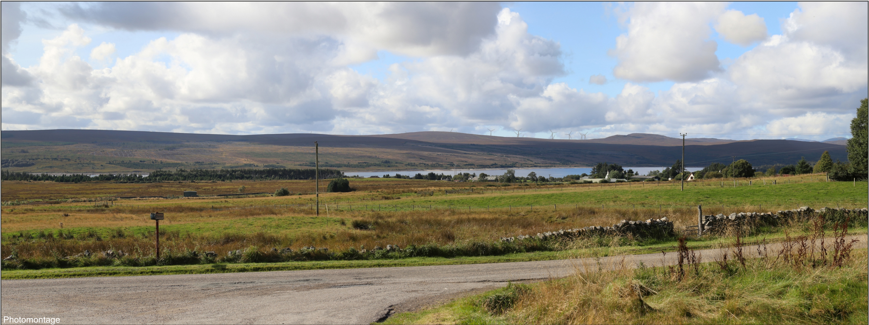
FIGURE V3b-5.2 - VP9: Achnairn Caravan and Camping Site Entrance (Photomontage)

OS reference: 255793 E 912701 N Distance to development: 9.6km Ground level: 144.8m AOD Direction of view: 248.8° Camera: Canon EOS 6D Focal length: 50mm vertical (27°) x 28mm horizontal (65.5°) Camera height: 1.5m Date: 23/09/2020 Time: 13:12