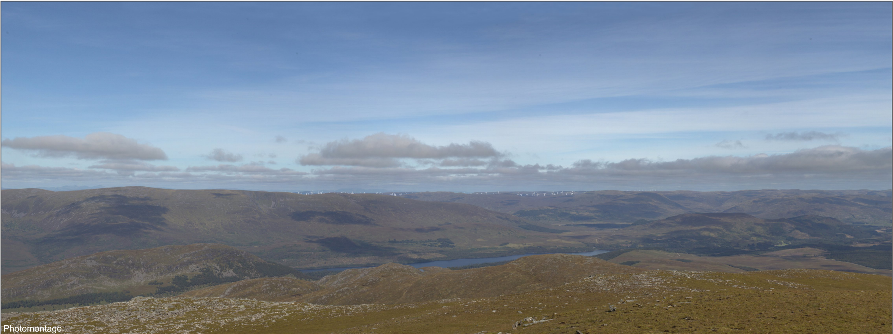
FIGURE 7.10.13.2 - VP13: Geal Charn (Ardverikie)

OS reference: 250441 E 781229 N Distance to development: 19.2km Ground level: 1040.76m AOD Direction of view: 4.89° Camera: Canon EOS 5D Mk II Focal length: 50mm vertical (27°) x 28mm horizontal (65.5°) Camera height: 1.5m Date: 07/09/2019 Time: 11:24 Drawing No. - 118025-D-LVIA7.10.13.2-3-1.0.0 Date - 17.04.2020