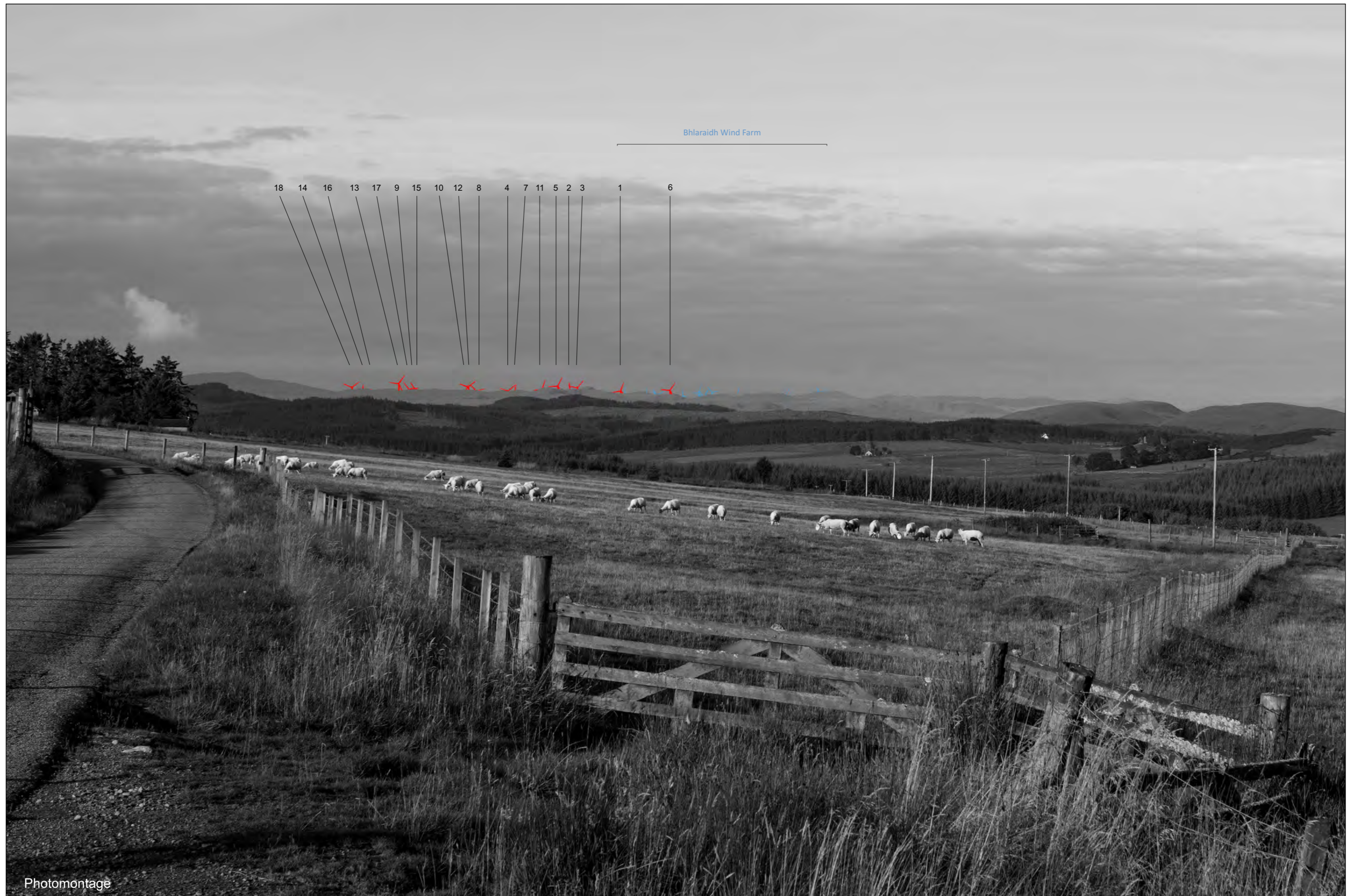
FIGURE 8.44.6 - VP 10: Great Glen Way near Carn a'Bhodaich - Monochrome Analysis

This image should be viewed at a comfortable arms length (approx 500mm)