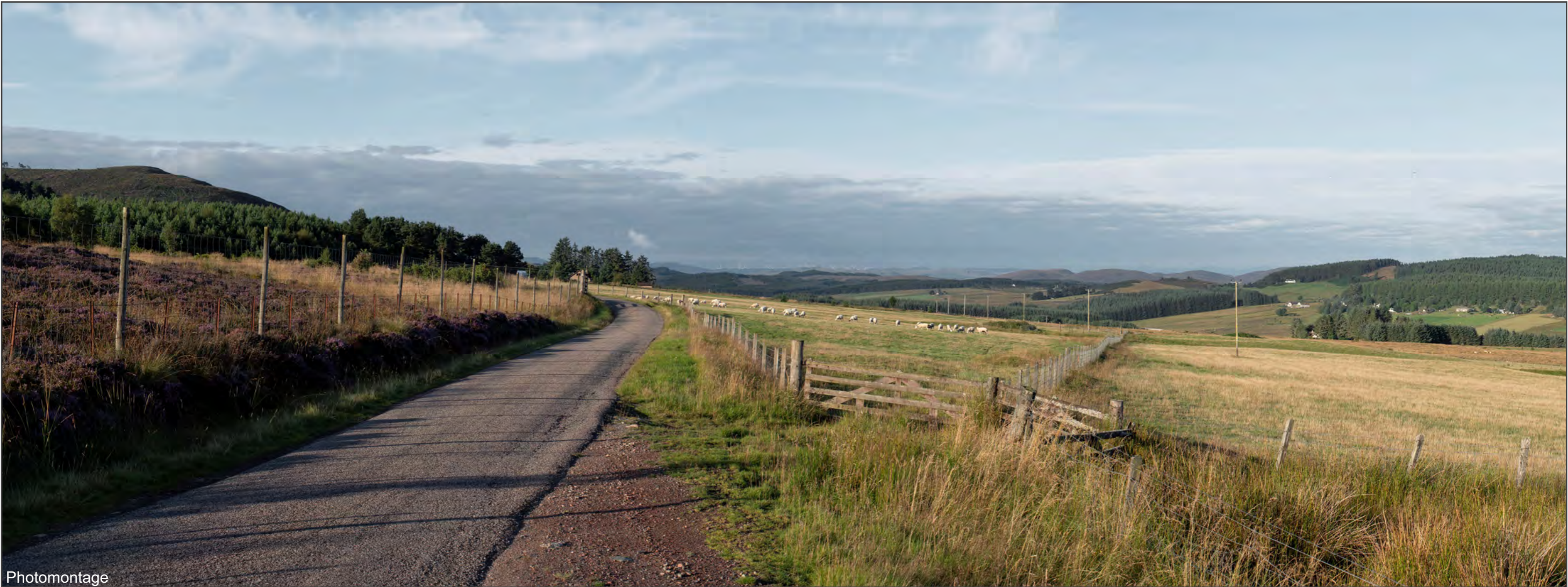
FIGURE 8.44.2 - VP10: Great Glen Way near Carn a’Bhodaich

OS reference: 256110 E 839075 N Nearest visible turbine: 23.2km Ground level: 313.3m AOD Direction of view: 223.2° Camera: Sony A7RIII ILCE-7RM3 Focal length: 50mm vertical (27°) x 28mm horizontal (65.5°) Camera height: 1.5m Date: 24/08/2020 Time: 07:49 Drawing No. - 119009-D-8.44.2-3-1.0.0 Date - 04/08/2021