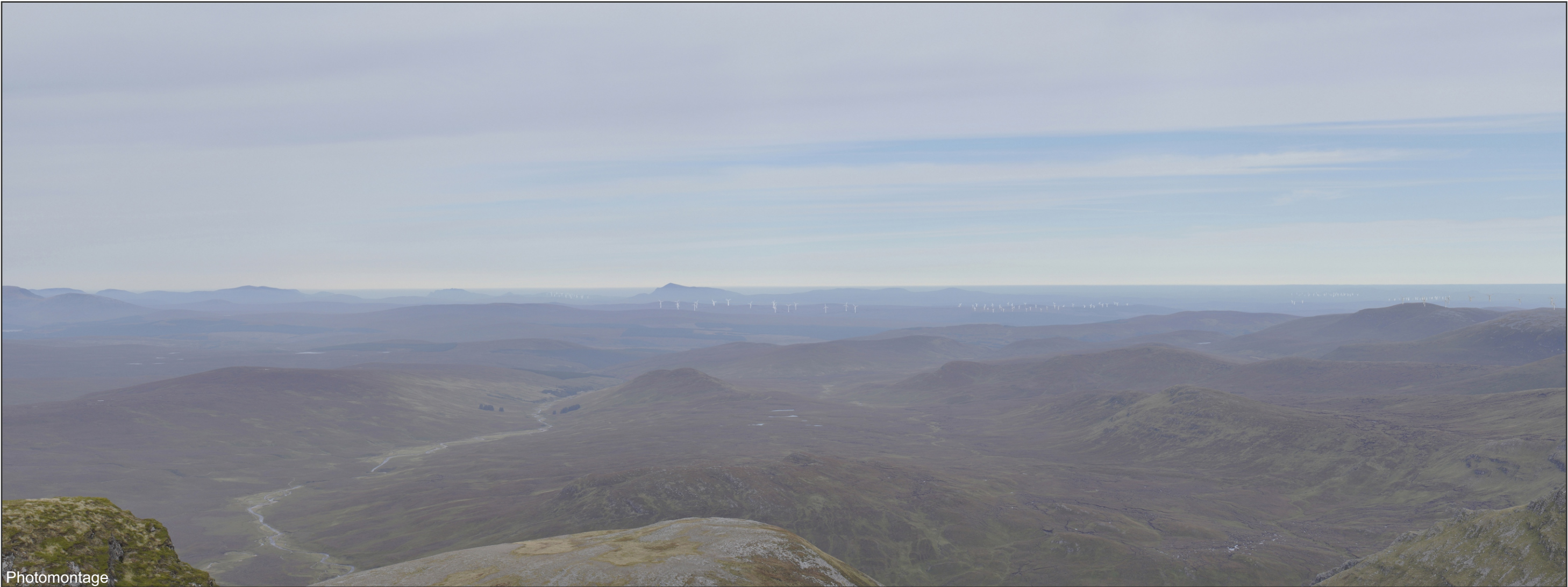
FIGURE V3b-13.2 - VP19: Seana Bhràigh (Photomontage)

OS reference: 228181 E 887872 N Distance to development: 26.5km Ground level: 927.4m AOD Direction of view: 41.0° Camera: Sony ILCE-7RM3 Focal length: 50mm vertical (27°) x 28mm horizontal (65.5°) Camera height: 1.5m Date: 27/09/2020 Time: 14:09