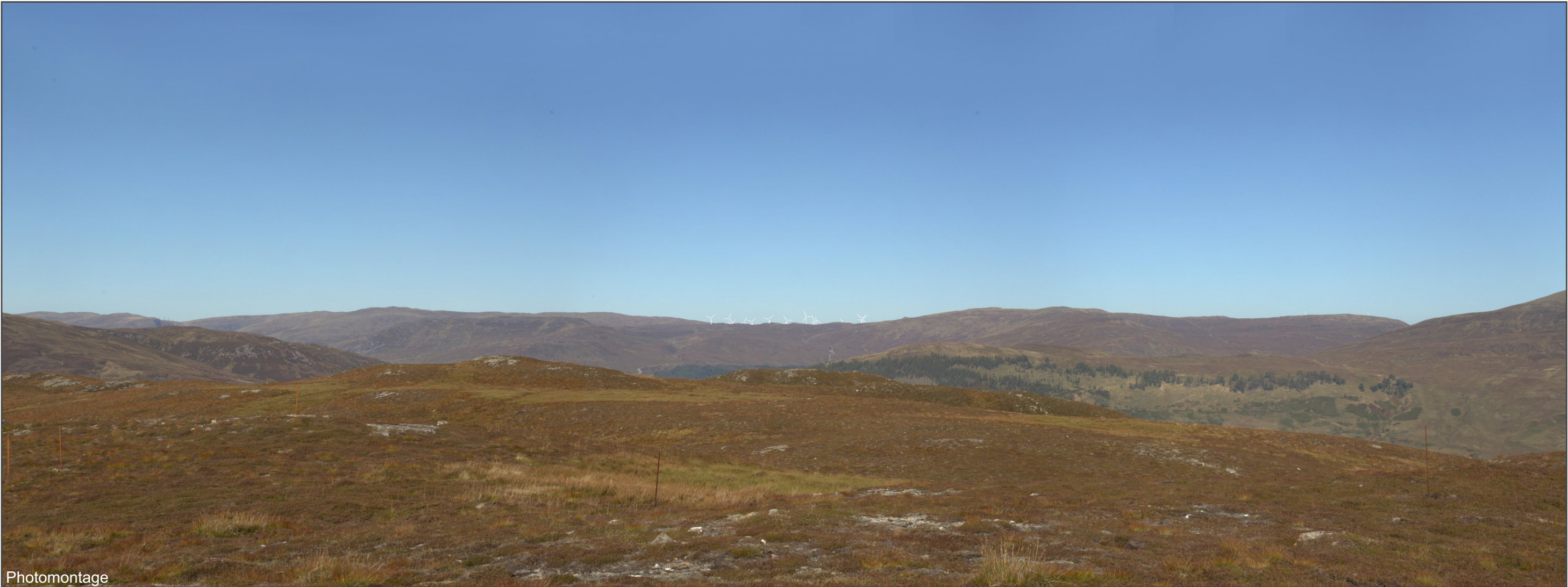
FIGURE 7.10.18.2 - VP18: Loch na Lairige

OS reference: 255806 E 791384 N Distance to development: 11.1km Ground level: 620.7m AOD Direction of view: 324.00° Camera: Canon EOS 5D Mk II Focal length: 50mm vertical (27°) x 28mm horizontal (65.5°) Camera height: 1.5m Date: 21/09/2019 Time: 10:44 Drawing No. - 118025-D-LVIA7.10.18.2-3-1.0.0 Date - 17.04.2020