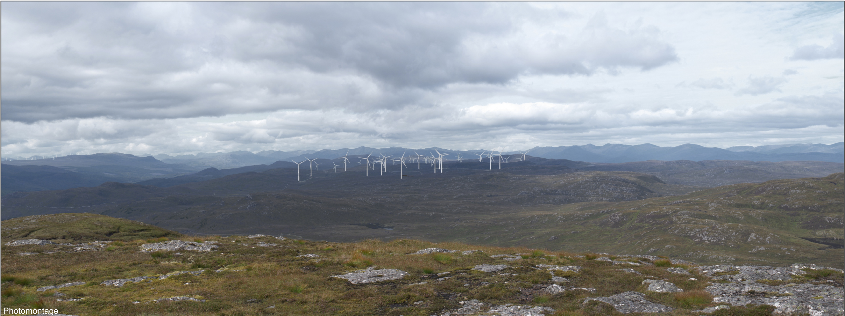
FIGURE V3b-3.2 - VP3: Meall Fuar-mhonaidh (Photomontage)

OS reference: 245699 E 822202 N Nearest visible turbine: 5.3km Ground level: 697.3m AOD Direction of view: 260.9° Camera: Sony A7RIII ILCE-7RM3 Focal length: 50mm vertical (27°) x 28mm horizontal (65.5°) Camera height: 1.5m Date: 03/04/2021 Time: 11:42