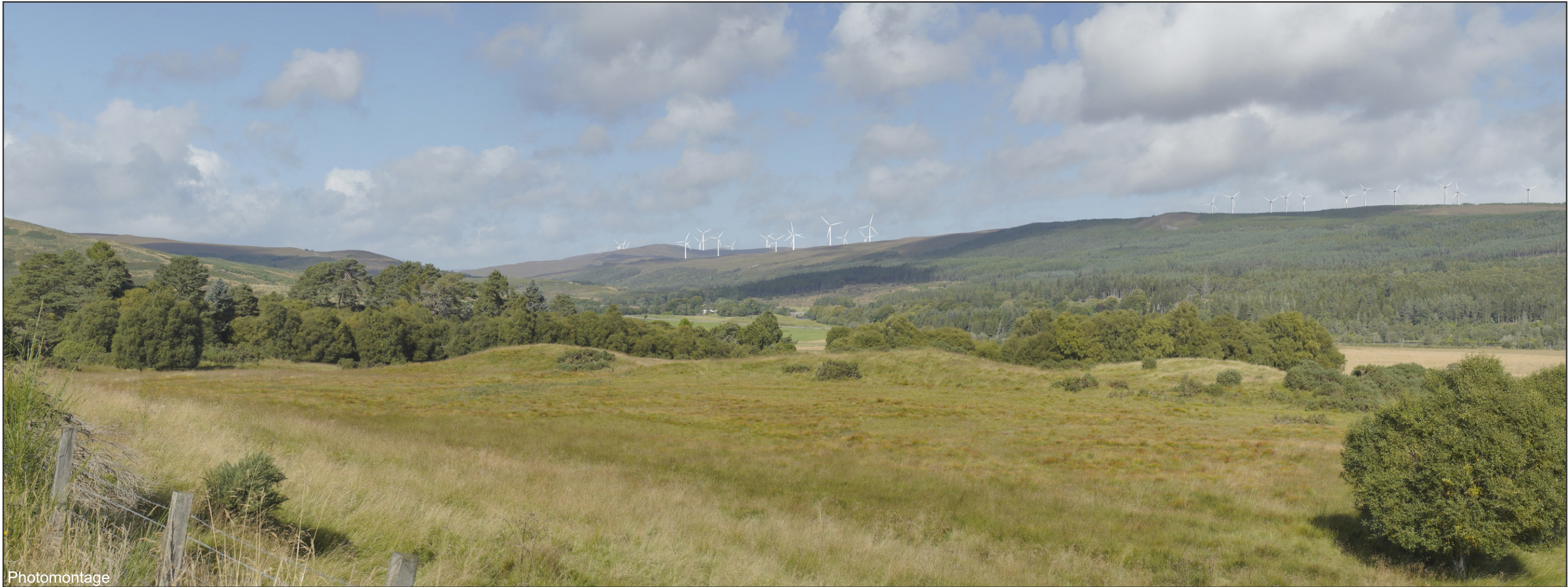
FIGURE V3b-11.2 - VP16: Minor Road at Inveroykel Forest Access (Photomontage)

OS reference: 247391 E 900319 N Distance to development: 6.4km Ground level: 39.4m AOD Direction of view: 353.0° Camera: Sony ILCE-7RM3 Focal length: 50mm vertical (27°) x 28mm horizontal (65.5°) Camera height: 1.5m Date: 12/09/2020 Time: 13:15