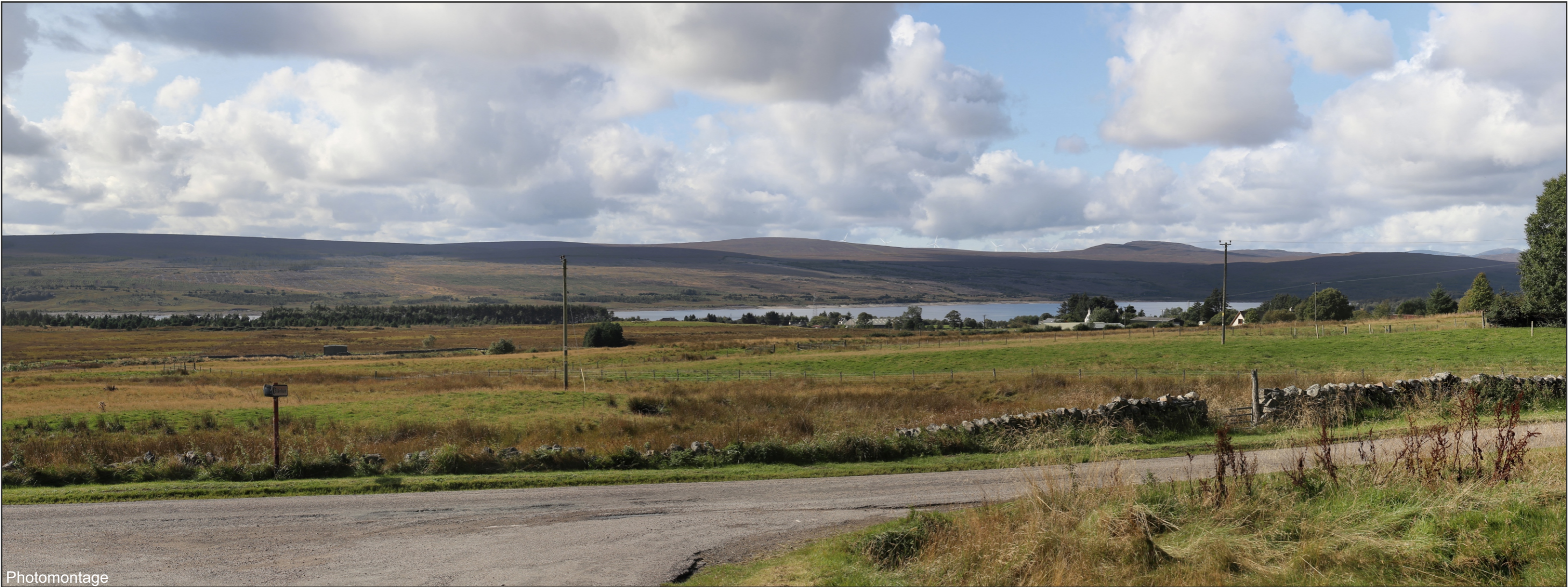
FIGURE 7.38.2 - VP9: Achnairn caravan and camping site entrance

OS reference: 255793 E 912701 N Distance to development: 9.6km Ground level: 144.8m AOD Direction of view: 248.8° Camera: Canon EOS 6D Focal length: 50mm vertical (27°) x 28mm horizontal (65.5°) Camera height: 1.5m Date: 23/09/2020 Time: 13:12 Drawing No. - 120008-D-EIA7.38.2-3-1.0.0 Date - 05.05.2021