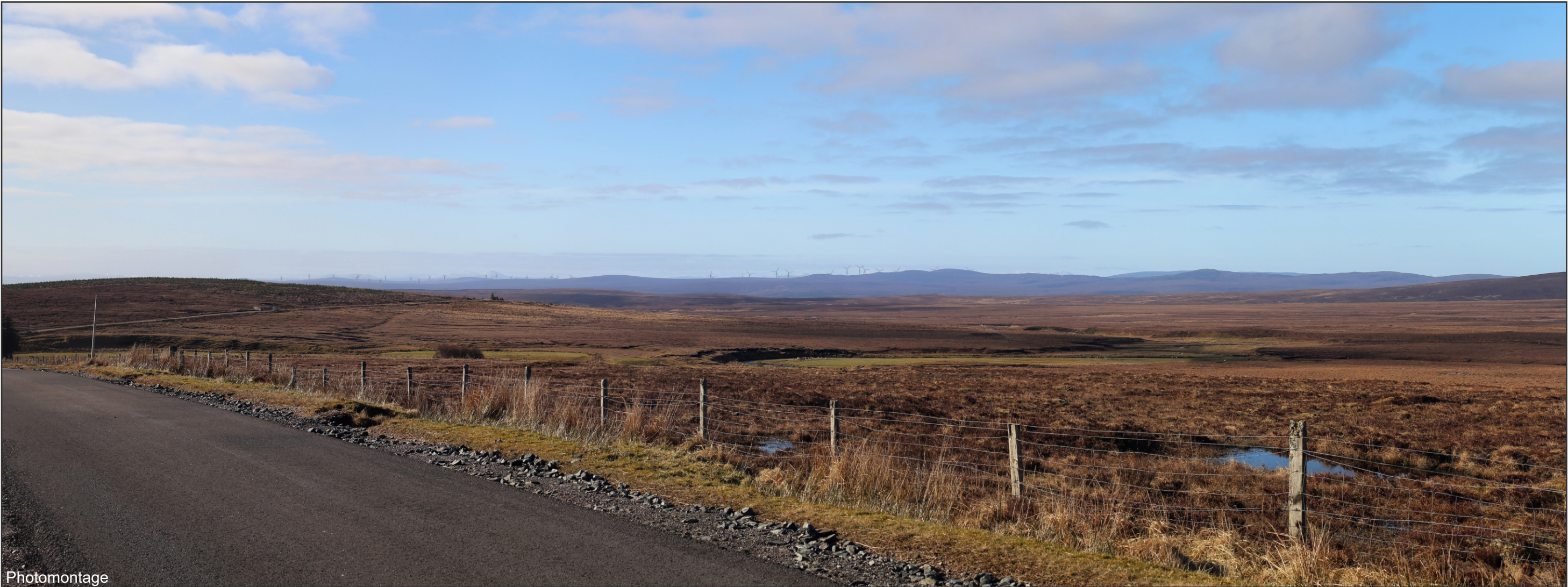
FIGURE V3b-1.2 - VP1: A836 Above the Crask Inn (Photomontage)

OS reference: 252294 E 925050 N Distance to development: 15.6km Ground level: 250.9m AOD Direction of view: 201.0° Camera: Canon EOS 6D Focal length: 50mm vertical (27°) x 28mm horizontal (65.5°) Camera height: 1.5m Date: 01/04/2021 Time: 10:21