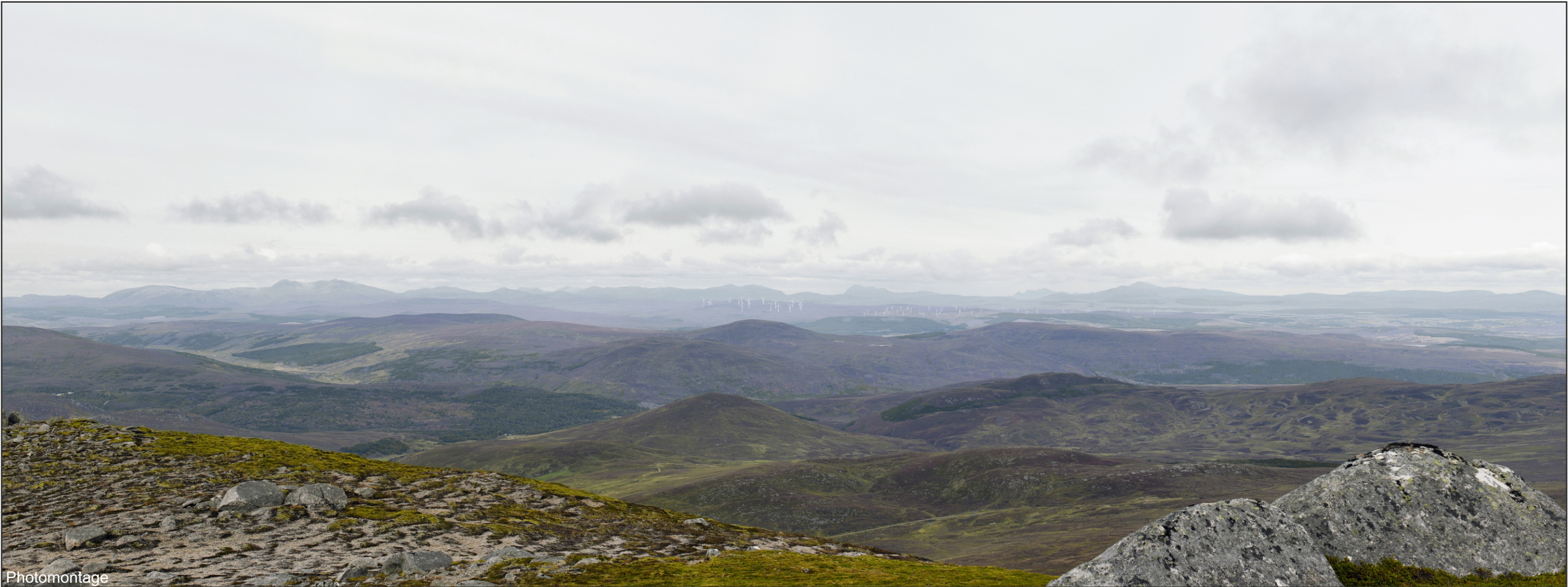
FIGURE V3b-12.2 - VP18: Carn Chuinneag (Photomontage)

OS reference: 248364 E 883320 N Distance to development: 23.4km Ground level: 834.8m AOD Direction of view: 356.0° Camera: Sony ILCE-7RM3 Focal length: 50mm vertical (27°) x 28mm horizontal (65.5°) Camera height: 1.5m Date: 24/09/2020 Time: 13:07