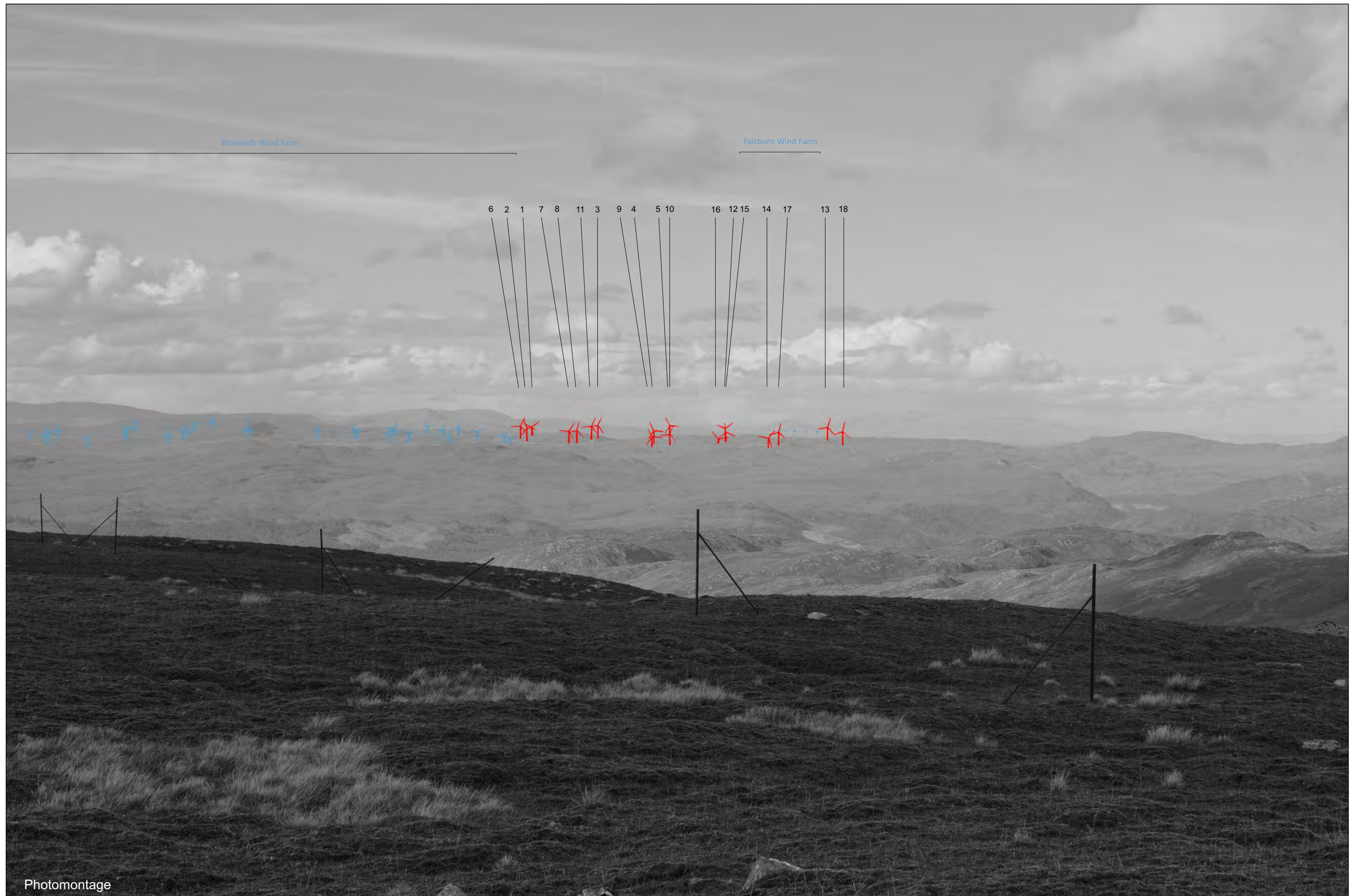
FIGURE 8.49.6 - VP 15: Poll-gormack Hill - Monochrome Analysis

This image should be viewed at a comfortable arms length (approx 500mm)