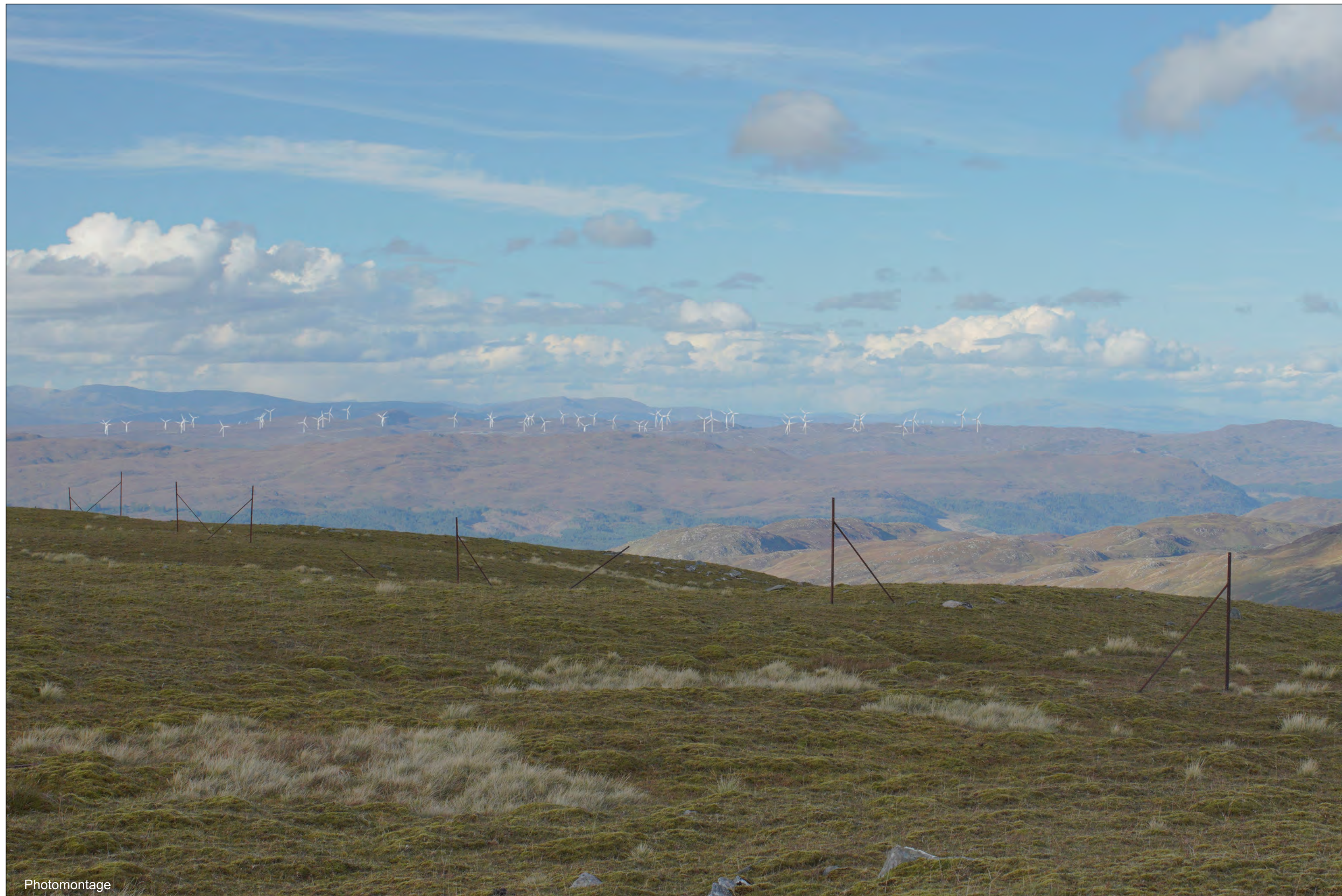
FIGURE 8.49.5 - VP 15: Poll-gormack Hill

This image should be viewed at a comfortable arms length (approx 500mm)