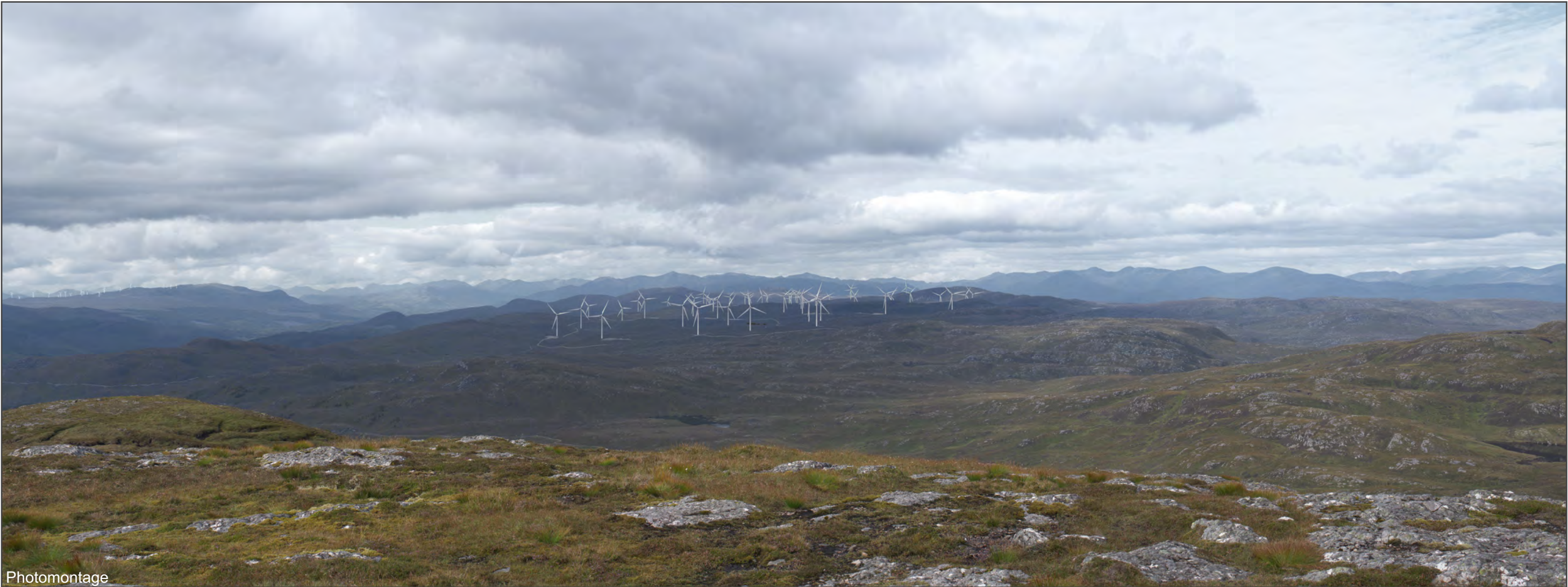
FIGURE 8.37.2 - VP3: Meall Fuar-mhonaidh

OS reference: 245699 E 822202 N Nearest visible turbine: 4.9km Ground level: 697.3m AOD Direction of view: 260.9° Camera: Sony A7RIII ILCE-7RM3 Focal length: 50mm vertical (27°) x 28mm horizontal (65.5°) Camera height: 1.5m Date: 03/04/2021 Time: 11:42 Drawing No. - 119009-D-8.37.2-3-2.0.0 Date - 06/08/2021