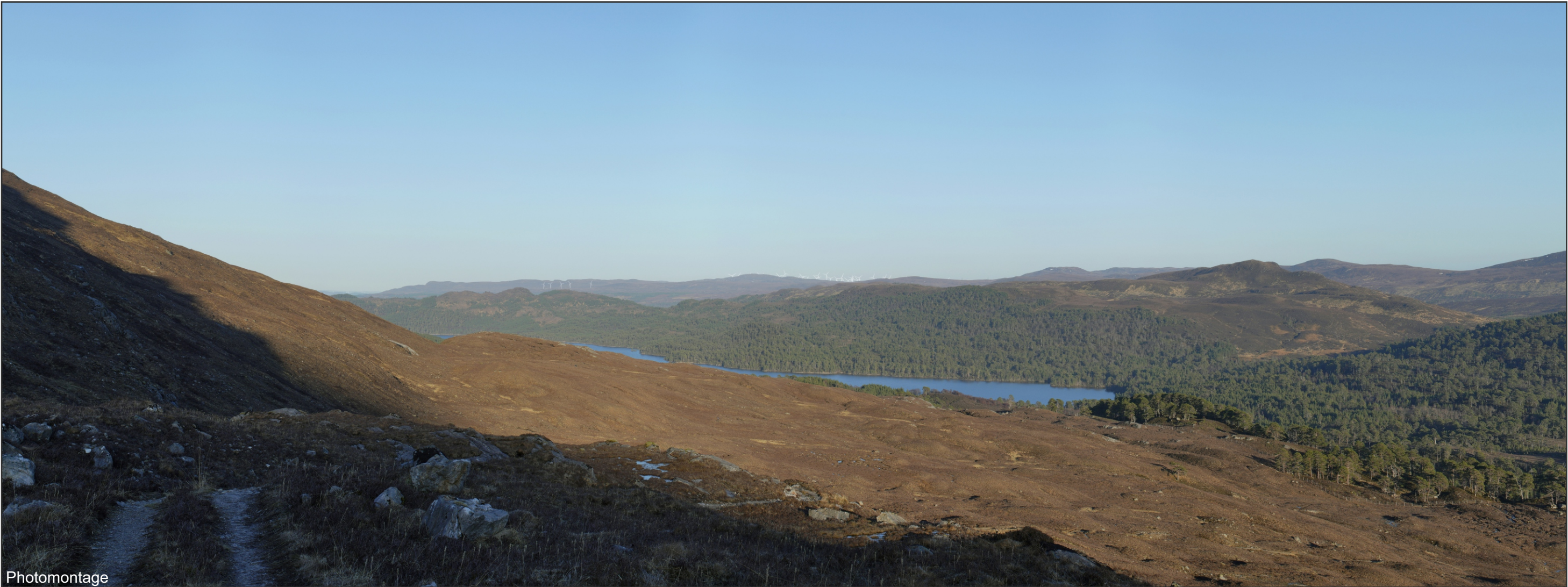
FIGURE V3b-13.2 - VP20: Path north of Affric Lodge (Photomontage)

OS reference: 218283 E 823945 N Nearest visible turbine: 20km Ground level: 428.8m AOD Direction of view: 97.5° Camera: Sony A7RIII ILCE-7RM3 Focal length: 50mm vertical (27°) x 28mm horizontal (65.5°) Camera height: 1.5m Date: 01/04/2021 Time: 18:44