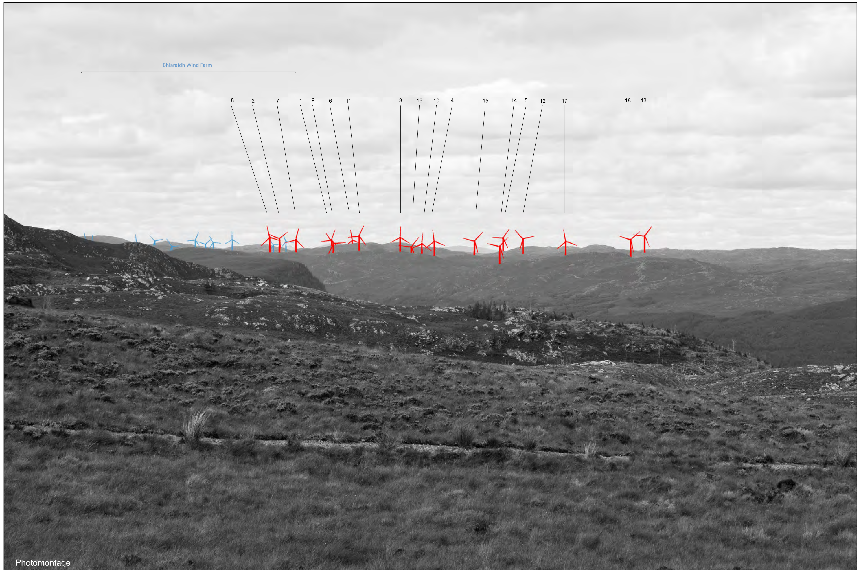
FIGURE 8.39.6 - VP 5: Suidhe Viewpoint, B862 - Monochrome Analysis

This image should be viewed at a comfortable arms length (approx 500mm)