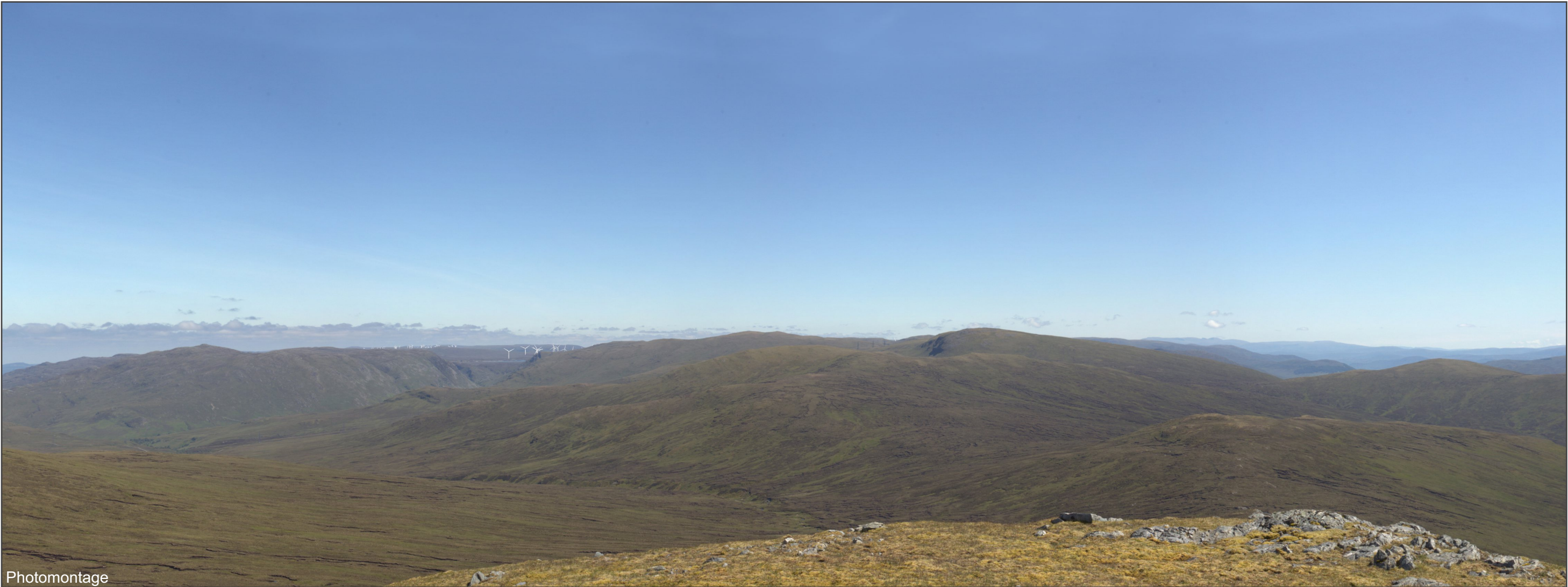
FIGURE 7.10.17.2 - VP17: Carn Dearg (Glen Roy)

OS reference: 235029 E 796630 N Distance to development: 12.8km Ground level: 813.0m AOD Direction of view: 69.90° Camera: Canon EOS 5D Mk II Focal length: 50mm vertical (27°) x 28mm horizontal (65.5°) Camera height: 1.5m Date: 26/06/2019 Time: 11:07 Drawing No. - 118025-D-LVIA7.10.17.2-3-1.0.0 Date - 17.04.2020