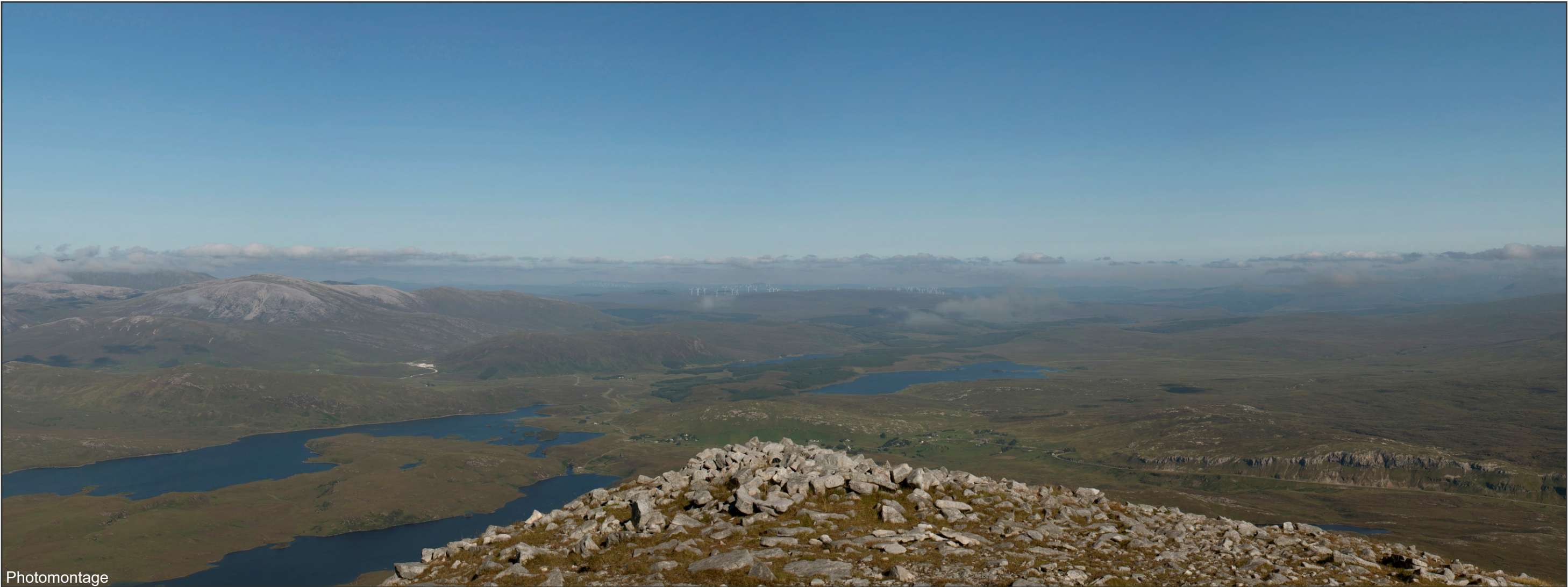
FIGURE V3b-14.2 - VP20: Cul Mòr (Photomontage)

OS reference: 216208 E 911909 N Distance to development: 28.4km Ground level: 848.9m AOD Direction of view: 96.0° Camera: Sony ILCE-7RM3 Focal length: 50mm vertical (27°) x 28mm horizontal (65.5°) Camera height: 1.5m Date: 14/08/2020 Time: 17:01