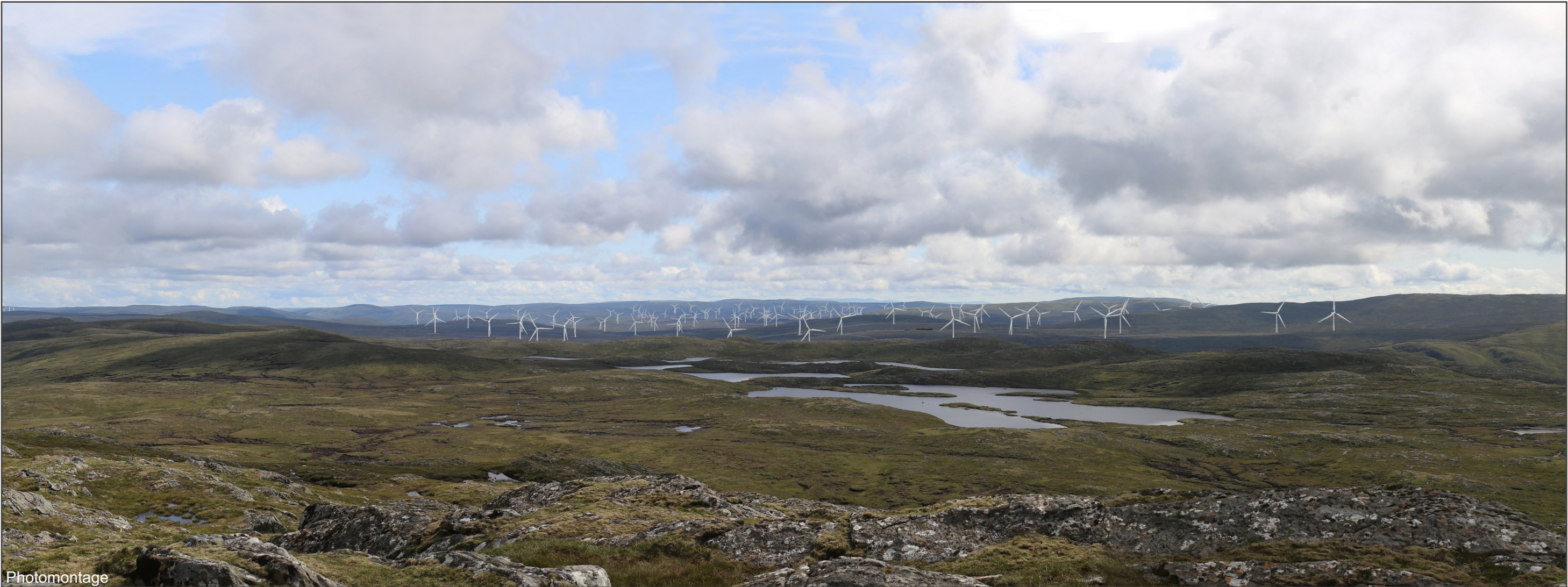
FIGURE 7.10.7.2 - VP7: Carn a Chuilinn

OS reference: 241679 E 803397 N Distance to development: 4.7km Ground level: 813.9m AOD Direction of view: 92.40° Camera: Canon EOS 6D Focal length: 50mm vertical (27°) x 28mm horizontal (65.5°) Camera height: 1.5m Date: 30/07/2019 Time: 12:01 Drawing No. - 118025-D-LVIA7.10.7.2-3-1.0.0 Date - 17.04.2020