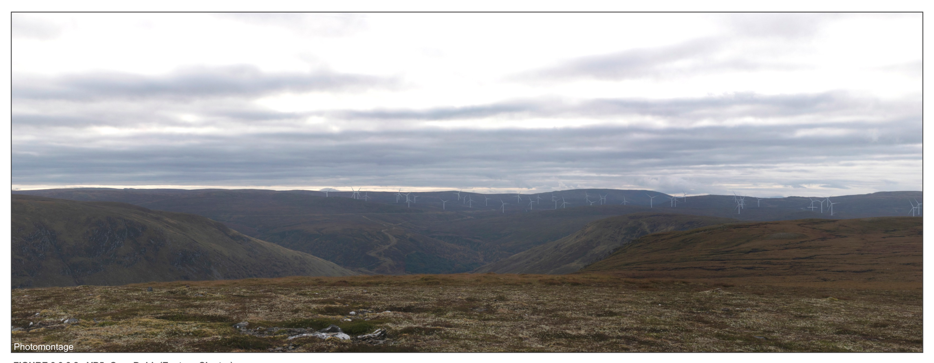
FIGURE 3.9.3.2 - VP5: Carn Dubh (Eastern Cluster)