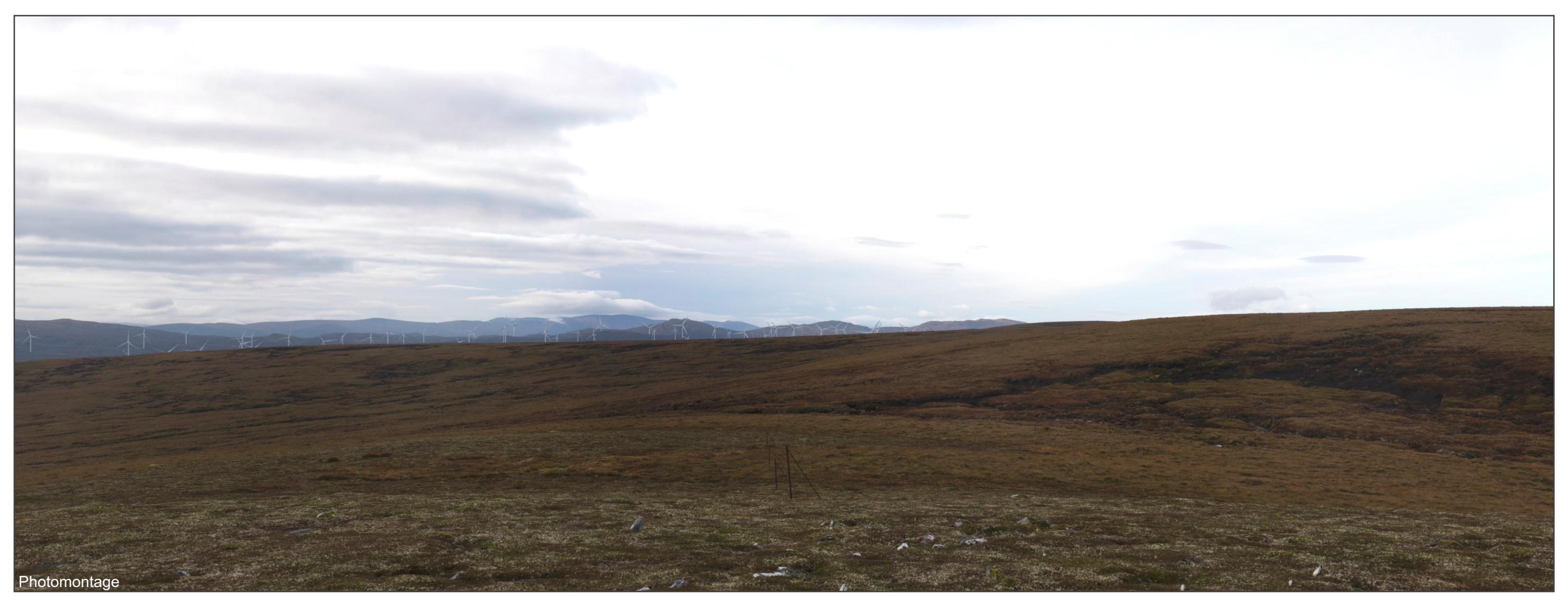
FIGURE 3.9.3.4 - VP5: Carn Dubh (Western Cluster)