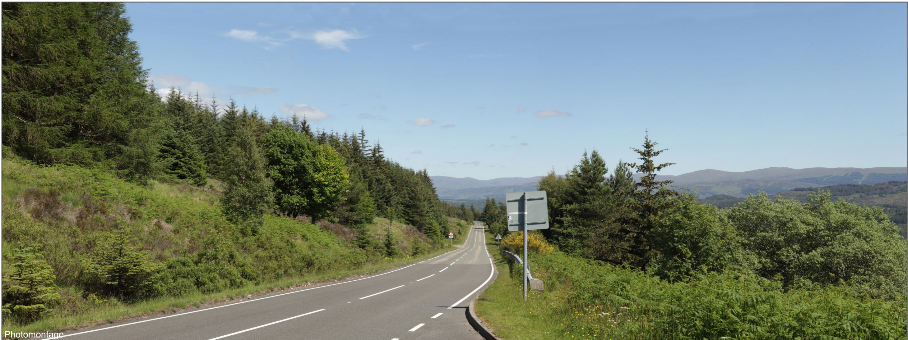
FIGURE 7.10.14.2 - VP14: A87, Loch Garry

OS reference: 221165 E 802845 N Distance to development: 25.0km Ground level: 240.27m AOD Direction of view: 89.0° Camera: Canon EOS 5D Mk II Focal length: 50mm vertical (27°) x 28mm horizontal (65.5°) Camera height: 1.5m Date: 26/06/2019 Time: 14:01 Drawing No. - 118025-D-LVIA7.10.14.2-3-1.0.0 Date - 17.04.2020