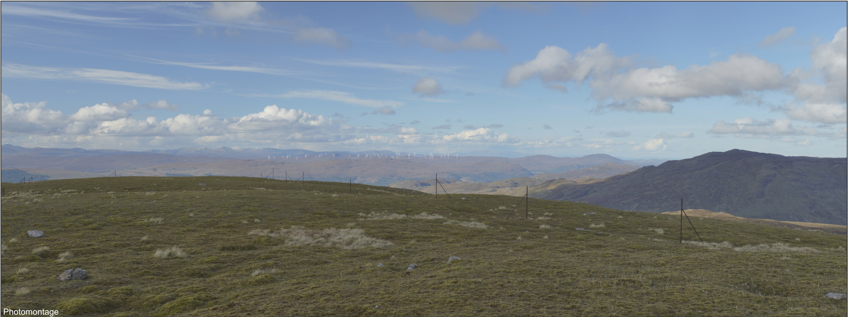
FIGURE V3b-11.2 - VP15: Poll-gormack Hill (Photomontage)

OS reference: 239054 E 797974 N Nearest visible turbine: 22.1km Ground level: 803.6m AOD Direction of view: 0.5° Camera: Sony A7RIII ILCE-7RM3 Focal length: 50mm vertical (27°) x 28mm horizontal (65.5°) Camera height: 1.5m Date: 23/09/2020 Time: 16:16