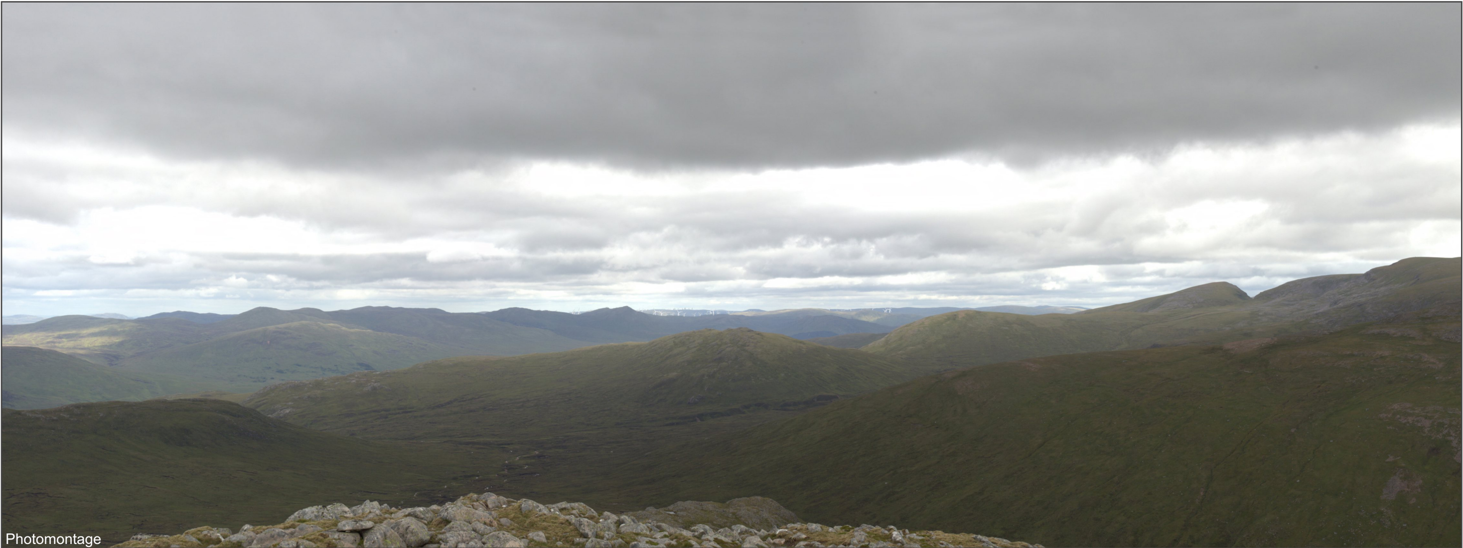
FIGURE 7.10.15.2 - VP15: Beinn Teallach

OS reference: 236142 E 785969 N Distance to development: 18.4km Ground level: 912.9m AOD Direction of view: 43.58° Camera: Canon EOS 5D Mk II Focal length: 50mm vertical (27°) x 28mm horizontal (65.5°) Camera height: 1.5m Date: 07/07/2019 Time: 10:58 Drawing No. - 118025-D-LVIA7.10.15.2-3-1.0.0 Date - 17.04.2020